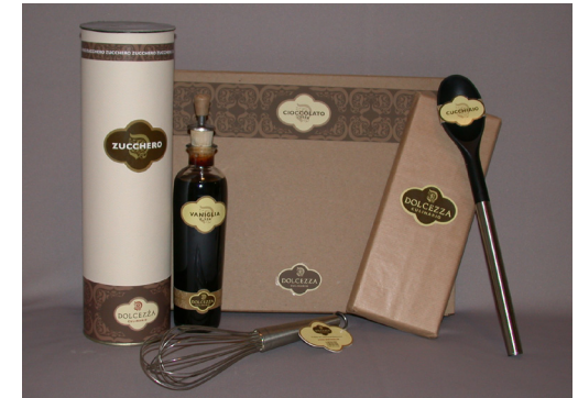
Dolcezza Packaging and Identity Created identity, packaging and standards manual.