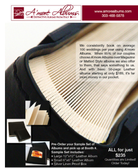
A'more Albums Magazine Ad Created ad to run in Modern Bride.