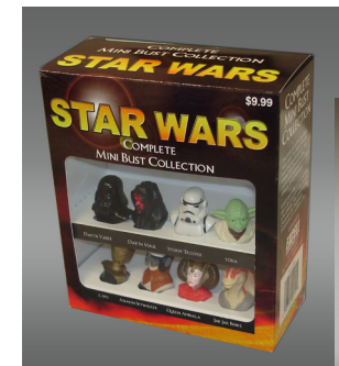
Star Wars Bust Packaging Created packaging design.