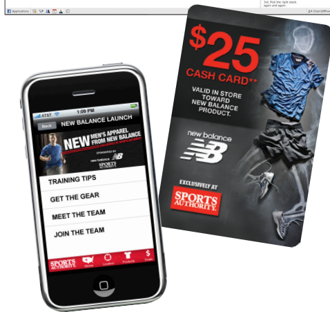
Sports Authority New Balance Launch Designed cash card for stores, i-pod and Facebook media.