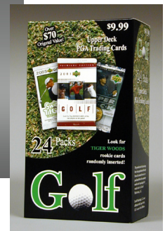
Golf Trading Cards Created packaging design.