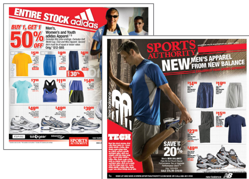
Sports Authority Insert Pages Set-up pages according to TSA brand standards.