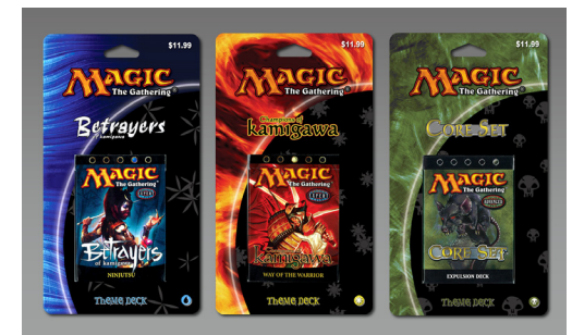
Magic: The Gathering Theme Deck Trading Card Set Created packaging, including backgrounds.