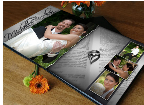
Storybook Wedding Album Created design, for bride and to be sample for photographer.