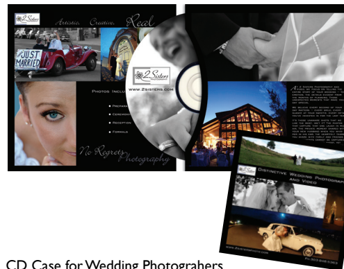
CD Case for Wedding Photographers Created design, handed out at NYC bridal fair.